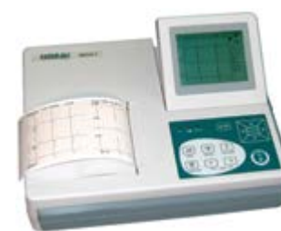
NECG-3 3 Lead