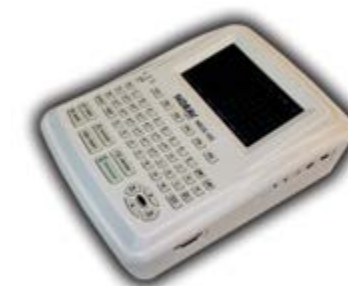
NECG-12C 12 Lead