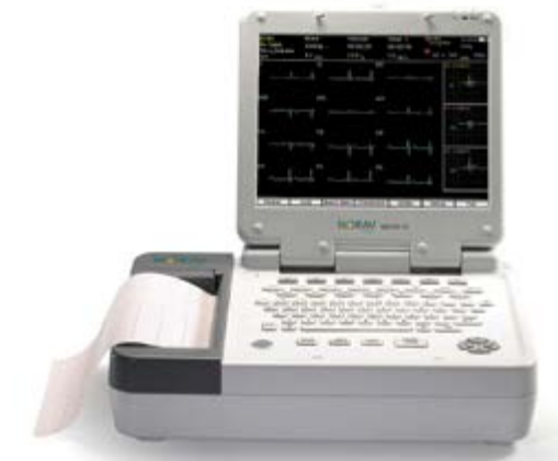
NECG-12 12 Lead